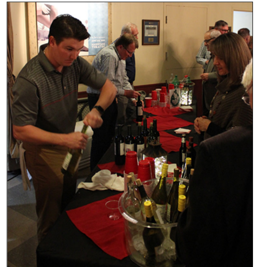
The Fundraising and Social Committee, Thank you for the gift of your talents in planning such a fabulous evening!